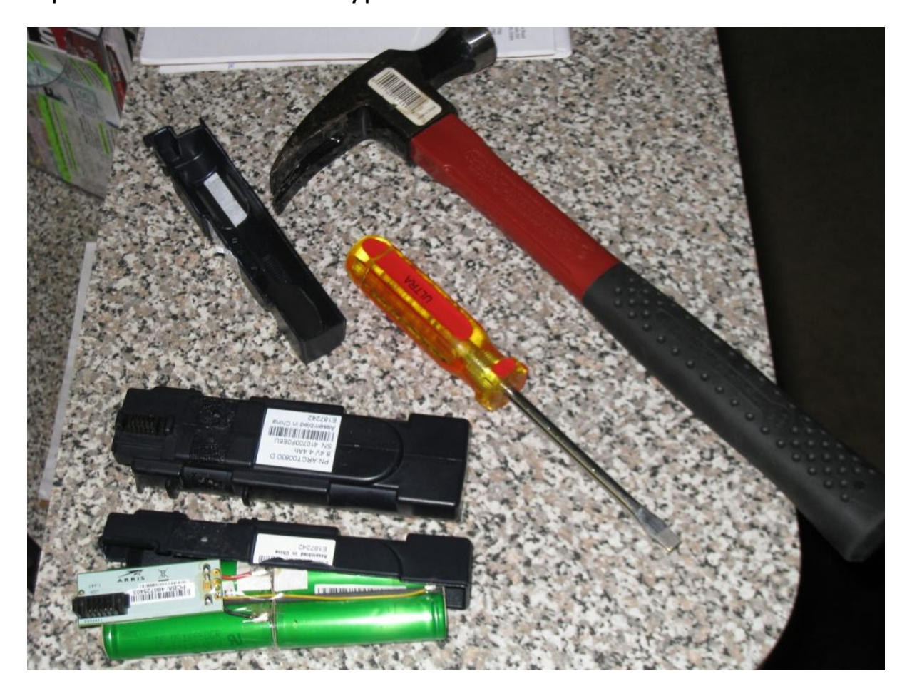
Step 1 – Remove cells from old battery pack

The batteries I used where in a plastic case. I removed all the stickers, and somewhat gently hit the case along the seam with a hammer. If done just right, the shell will fall apart, (I didn't even need the screw driver) and you get some yummy cells.